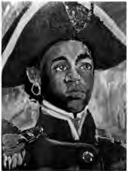
Patrick Noze Sanite Belair A Haitian revolutionary Lieutenant in the army of Toussaint Louverture Acrylic on Canvas 18" x 24" $4,500