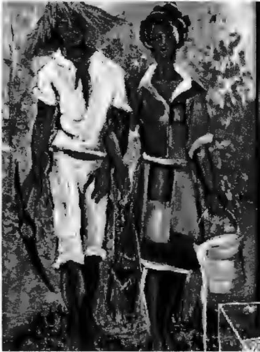
Patrick Noze Man and Woman Acrylic on Canvas 40" x 60" $3,000