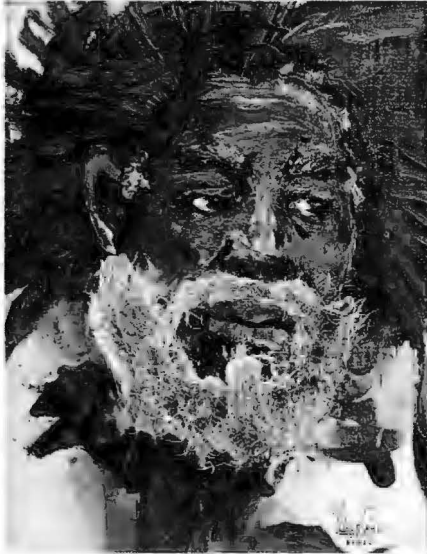
Patrick Noze Premier Pitit Acrylic on Canvas 16" x 20" $1,500