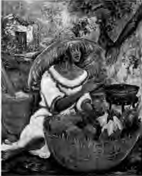
Patrick Noze Monin Piece Acrylic on Canvas 51" x 60" $8,000