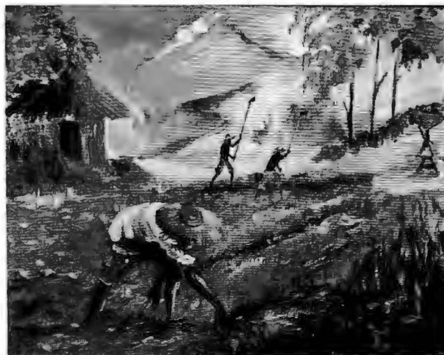
Patrick Noze Field Worker Acrylic on Canvas 24" x 36" $4,000