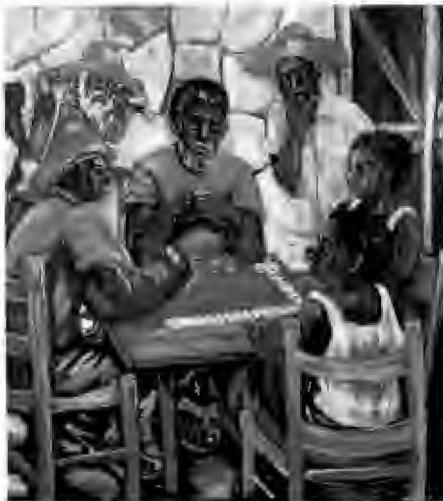
Patrick Noze Jwet Domino Acrylic on Canvas 48" X 48" $10,000