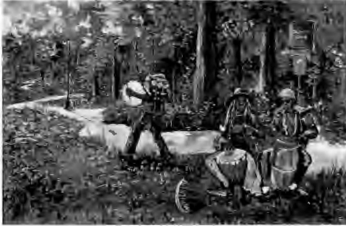
Patrick Noze Drummers Grove Acrylic on Canvas 32" x 49" $3,500