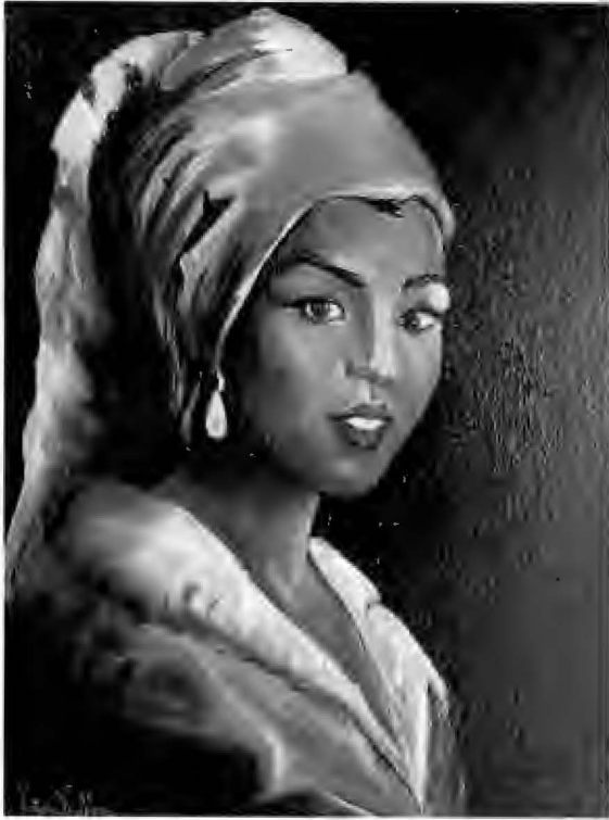
Patrick Noze The Pearl Oil on Canvas 13" x 20" $10,000