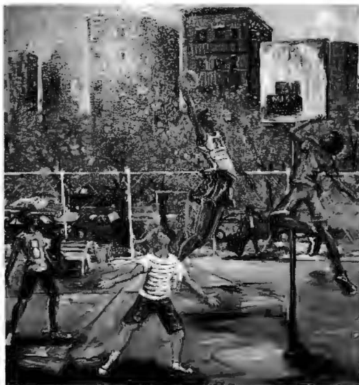
Patrick Noze New York Ave Loop Acrylic on Canvas 48" x 48 $10,000