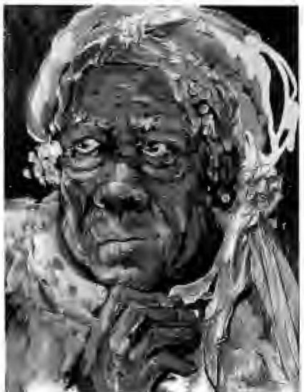
Patrick Noze The Wise Women Acrylic on Canvas 16" x 20" $1,500