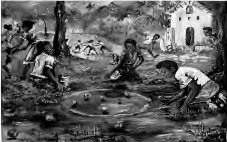
Patrick Noze Children at Play Acrylic on Canvas 48" x 60" $5000