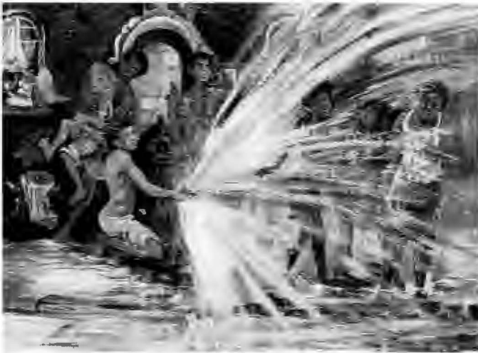
Patrick Noze Summer Heat Acrylic on Canvas 30" x 40" $3,500