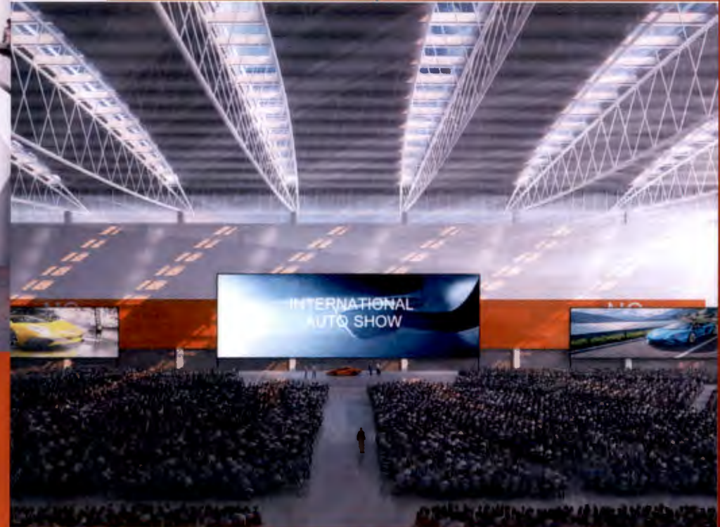
Project 5B: Multipurpose Venue