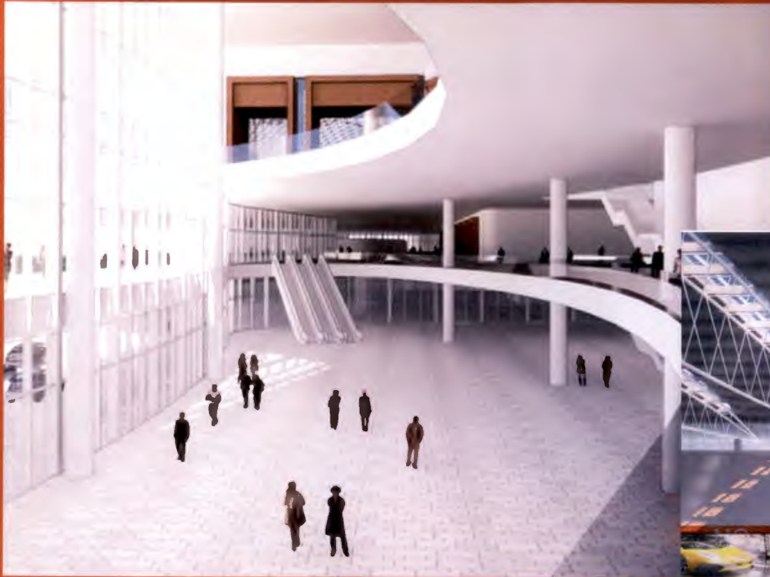
Project 5A: Convention Way Grand Concourse