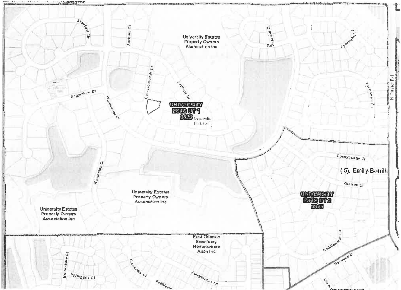
University Estates Unit 1