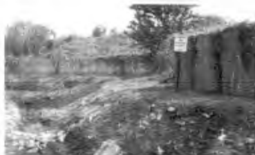
The front of the now abandoned A-Z Recycling Center in Bithlo.

Tags: "toxic waste" , Bithlo , dumping , Water Contamination