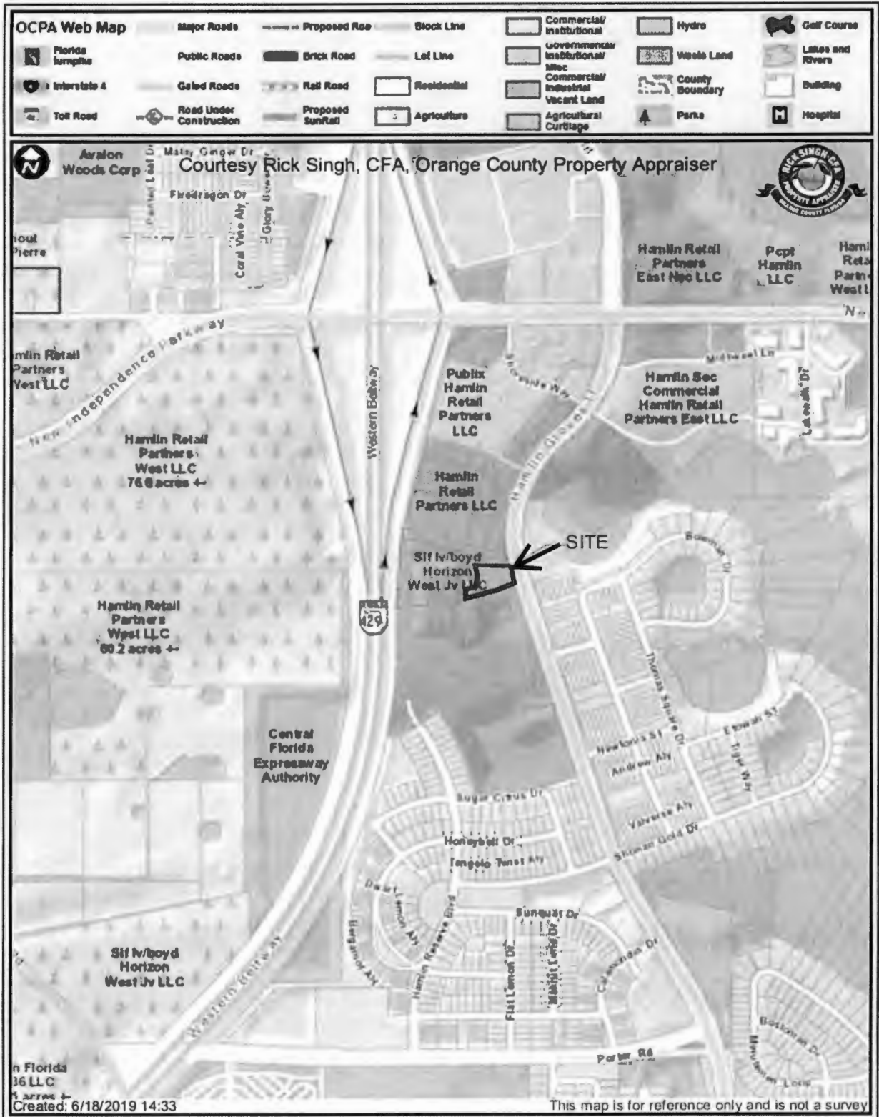
Exhibit "A" "McCoy Federal Credit Union at Hamlin" Project Location Map