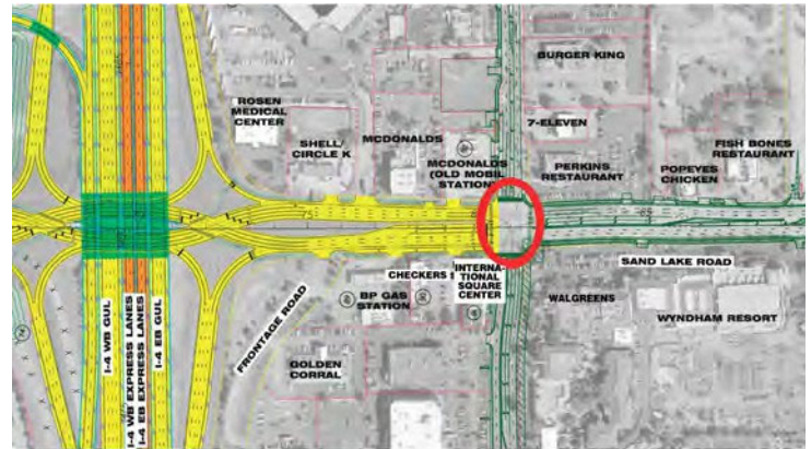
PEDESTRIAN BRIDGE LOCATION - SAND LAKE ROAD & INTERNATIONAL DRIVE

The County invites you to attend a public community meeting to review the preferred alternative under consideration and to provide input on Tuesday, June 17, 2025, at the Orange County Commission Chambers, 201 S. Rosalind Avenue, Orlando, FL 32801 at 2PM (or shortly thereafter).