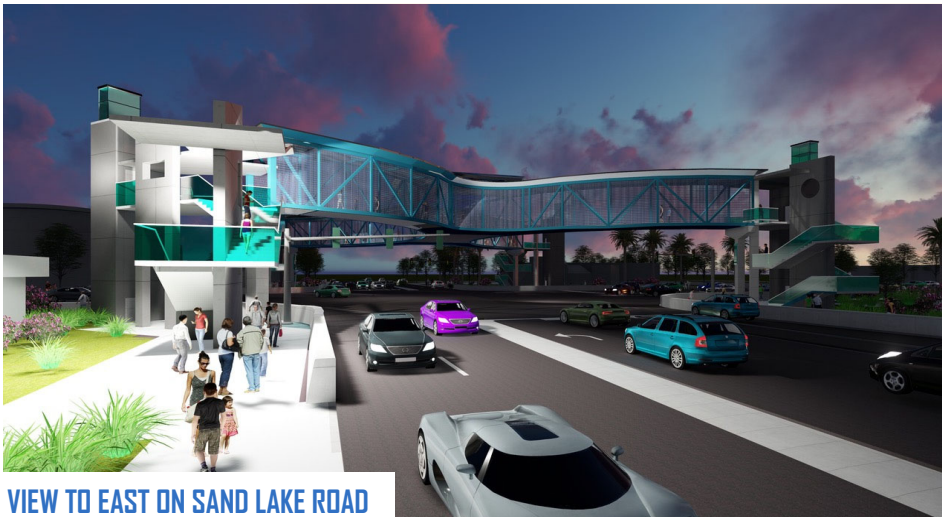
VIEW TO EAST ON SAND LAKE ROAD