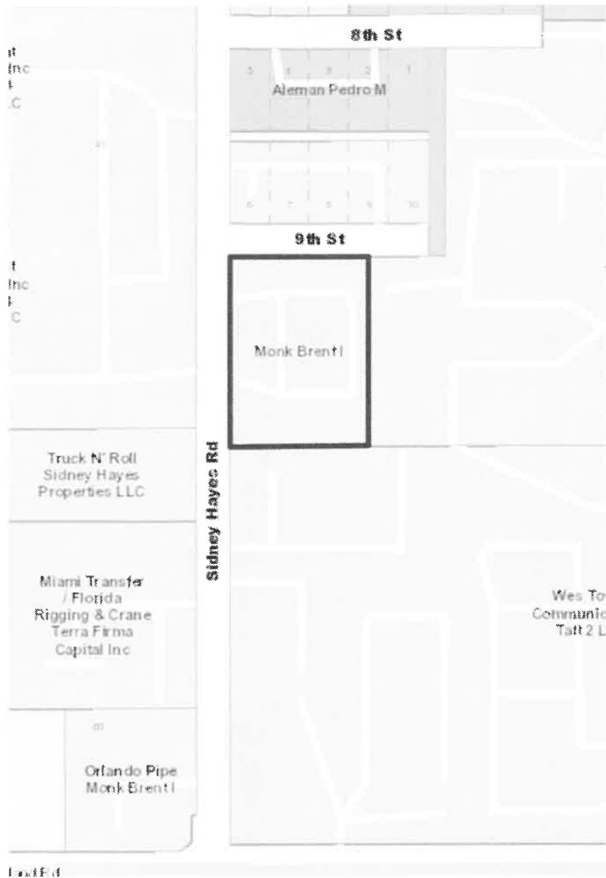
Exhibit "A" Orlando Pipe Project Location Map