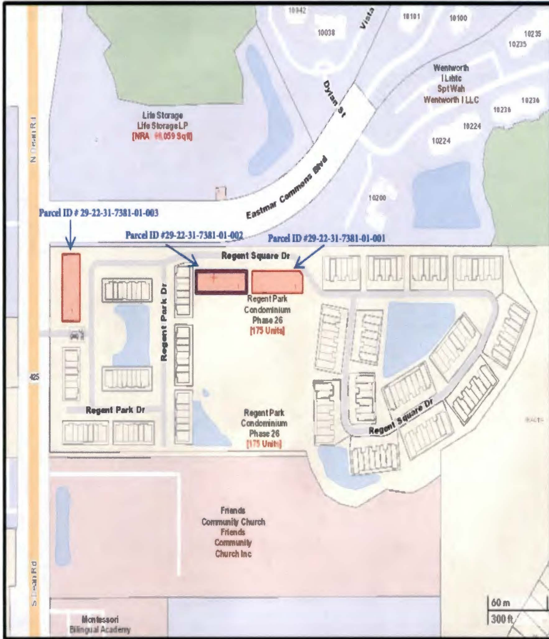
EXHIBIT "A" "REGENT PARK CONDOS" PROJECT LOCATION MAP