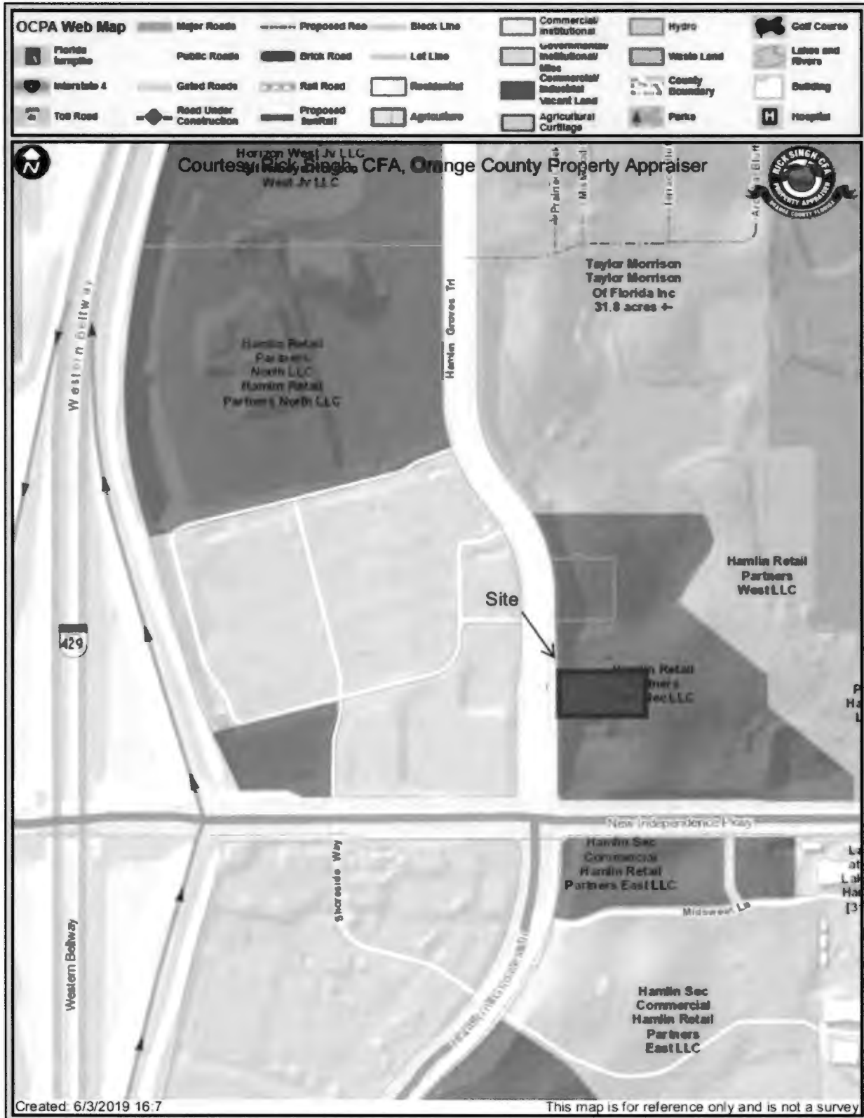
Exhibit "A" "Taco Bell/Pizza Hut at Hamlin" Project Location Map