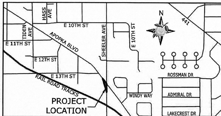
ORANGE COUNTY, FLORIDA - VICINITY MAP NOT TO SCALE

CCR = CERTIFIED CORNER RECORD ID = IDENTIFICATION LB = LICENSED BUSINESS ORB = OFFICIAL RECORD BOOK PG(S) = PAGE(S) PLS = PROFESSIONAL LAND SURVEYOR PB = PLAT BOOK PSM = PROFESSIONAL SURVEYOR & MAPPER R#E = RANGE RLS = REGISTERED LAND SURVEYOR R/W = RIGHT-OF-WAY T#S = TOWNSHIP ○ = CHANGE IN DIRECTION