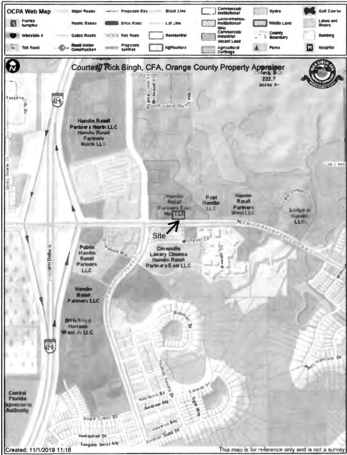
Exhibit "A" "Wawa at Hamlin" Project Location Map