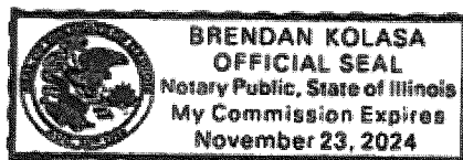
Name of Notary, Typed, Printed, or Stamped