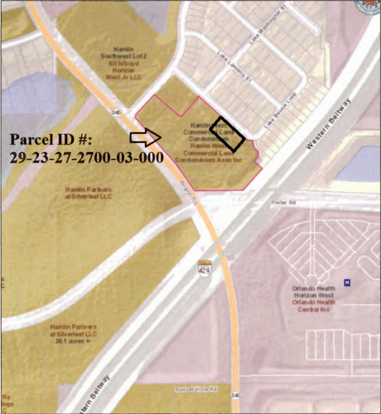
Exhibit A “UR5 BUILDING B” Project Location Map