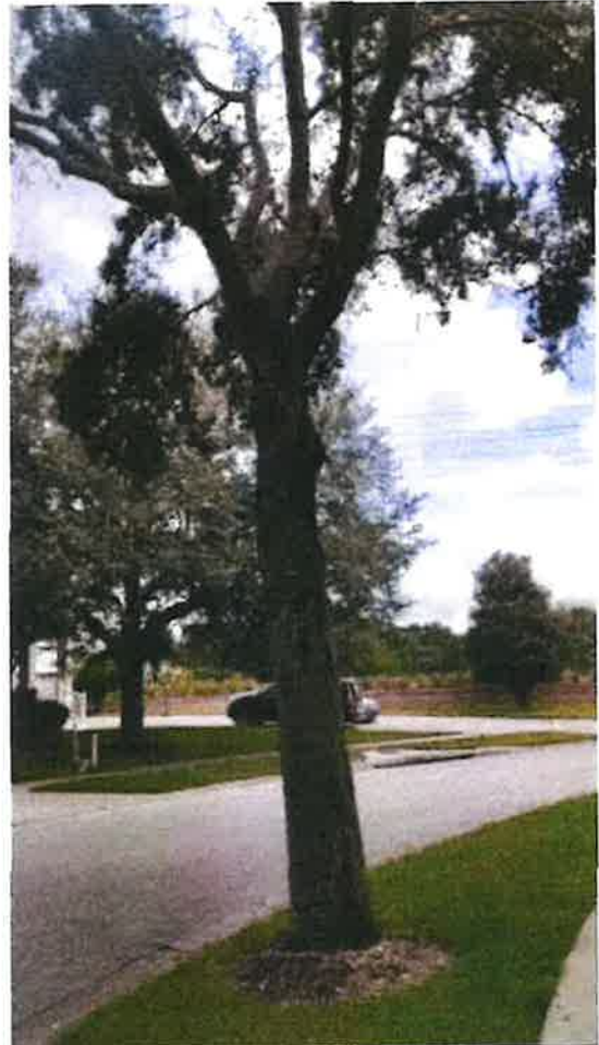
Oak tree in swale, has severe dieback of canopy showing in secondary and primary branches, sloughing bark along trunk, very poor overall health, leaning toward street, Removal recommended.

Tree 335 has severe health and structure damages visible. This tree was assessed as High Risk, with removal the reasonable action to reduce risk level below moderate per FS163.045 terms. A permit may not be required by Orange County for removal of this tree, but we recommend to review this Report with County staff for their approval.