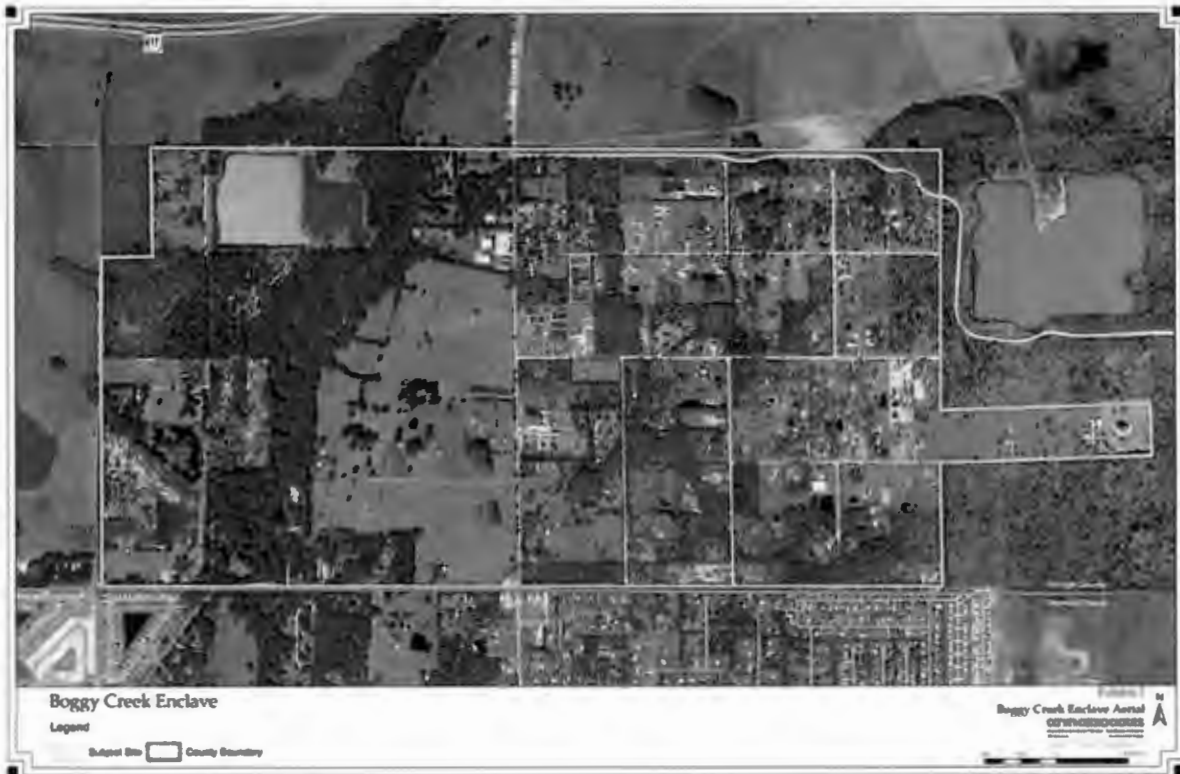
Figure 1 Boggy Creek Enclave.

include the entire enclave, changing the Future Land Use designation from Rural to Boggy Creek Neighborhood District with policies in the Comprehensive Plan. Along with the policies a conceptual master plan identifying land uses, densities, roadways, and parks was proposed. The overall goal of this was to ensure consistent development and interior pedestrian and vehicular circulation. It was noted that the eastern portion of the Boggy Creek Enclave was to remain in its current development framework and “limit future attempts at urban scale development applications in the eastern portion of the BCE.” This proposal was not adopted. Since that time development has occurred piecemeal as individual applications for future land use map amendments and Urban Service Area Boundary Expansions have been submitted.