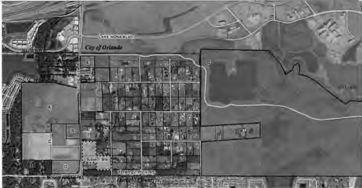
Table 1 Previous and Proposed Amendments in the Boggy Creek Area