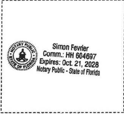
Notary Seal Above

Sworn to and subscribed before me, this 16 th day of May , 20 25