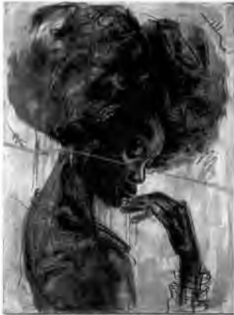
Where there's nothing left