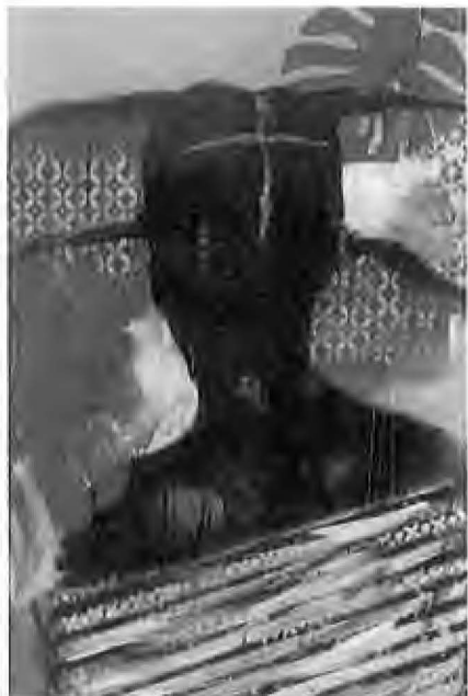
A cage wen in search of a bird