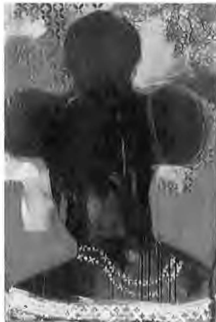
How do I tell a turtle that I am slower than he