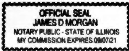
Name of Notary, Typed, Printed, or Stamped