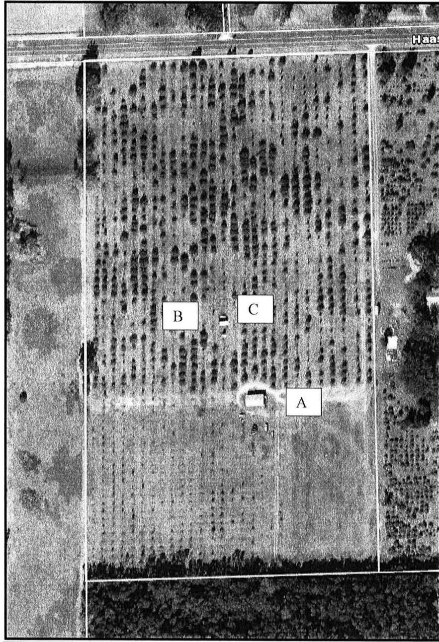
EXHIBIT A AERIAL MAP OF STRUCTURES ON PARCEL ID 07-20-28-0000-00-005