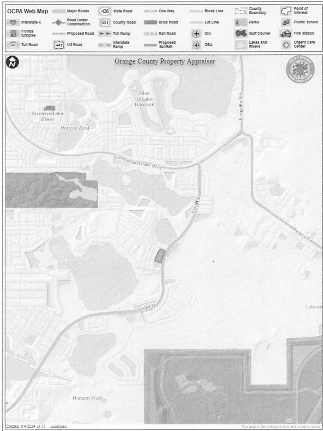
Exhibit "A" "SHOPPES AT LAKEVIEW" Project Location Map