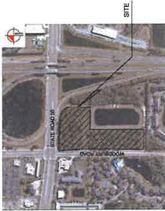
SECTION 23, TOWNSHIP 22 SOUTH, RANGE 31 EAST VICINITY MAP