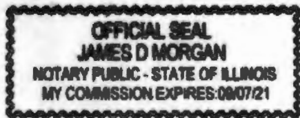
Name of Notary, Typed, Printed, or Stamped