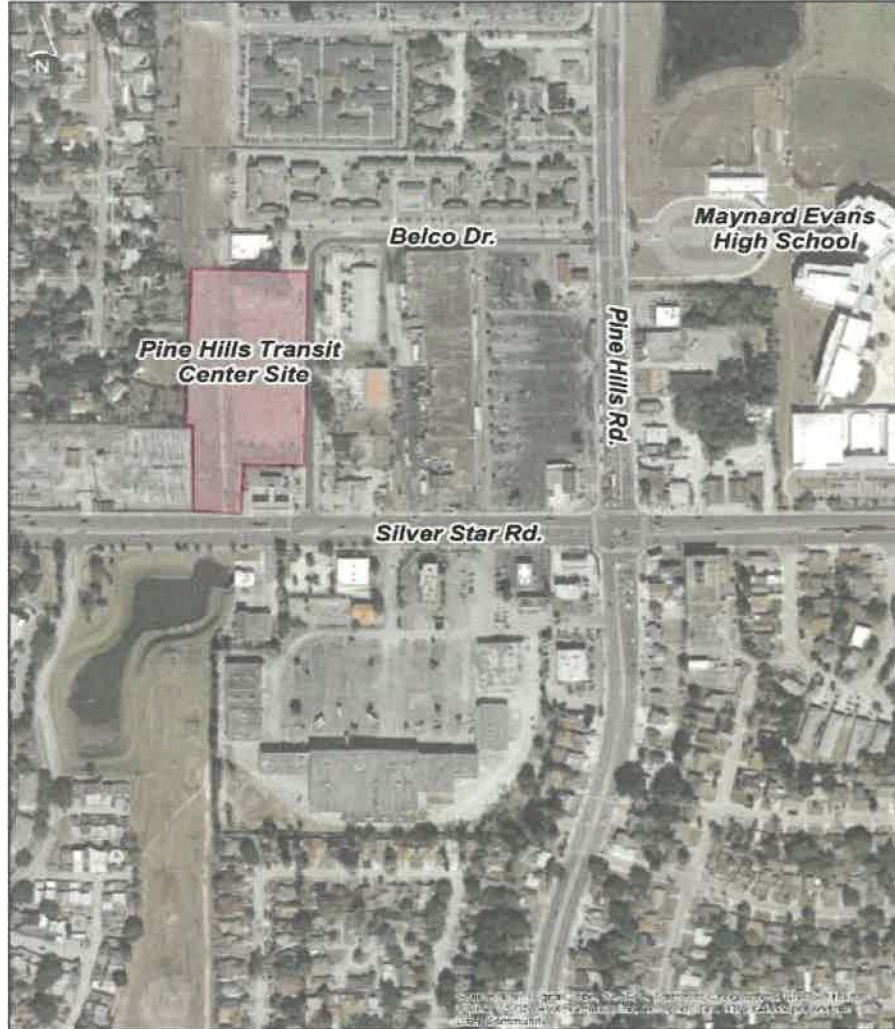
EXHIBIT A – SKETCH #1