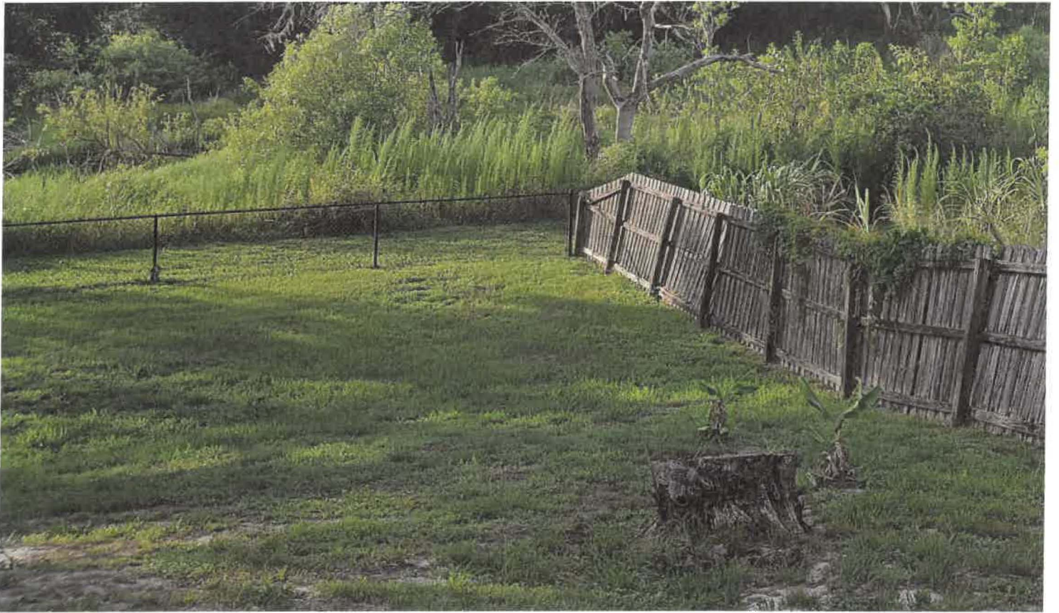
OCTOBER 2024 before and after Hurricane Milton