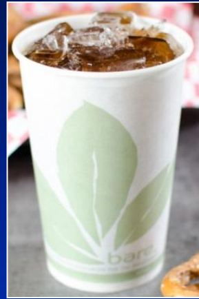
Eco Hot/Cold Paper Cup $0.04 more/cup