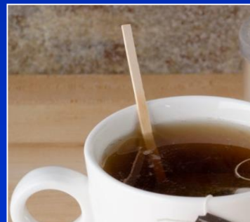
Wooden stirrers Same price