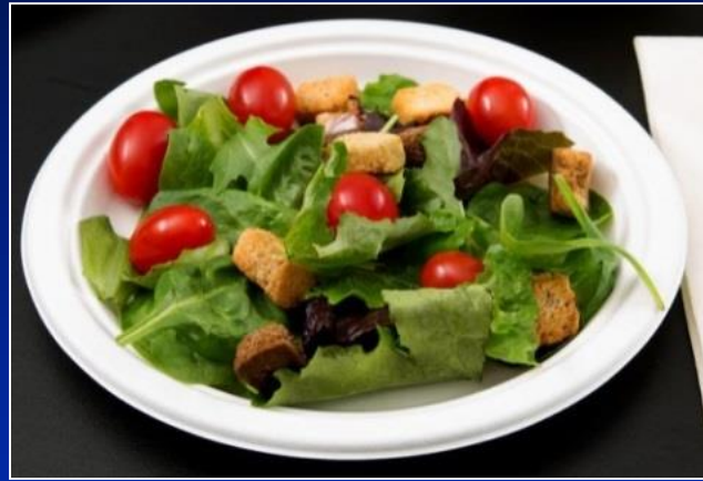
Compostable/Paper Plates $0.03 more/plate