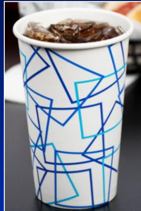
Hot/Cold Paper Cup Same price