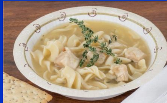
Compostable/Paper Bowls Range $0.04 – 0.09 more/item