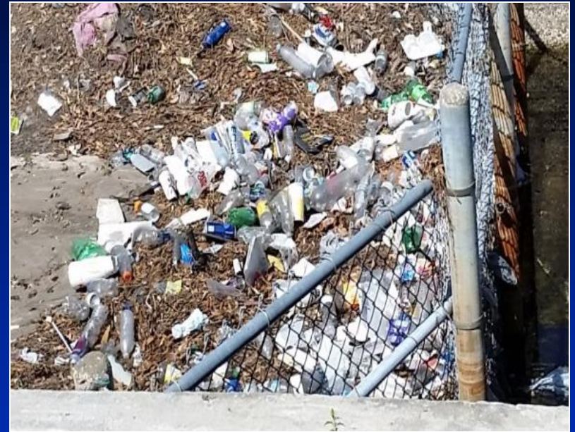
Orange County Pump Station