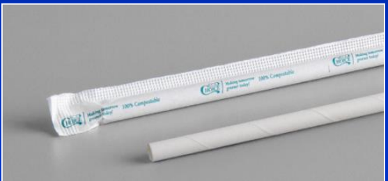
Paper straw $0.01 more/straw