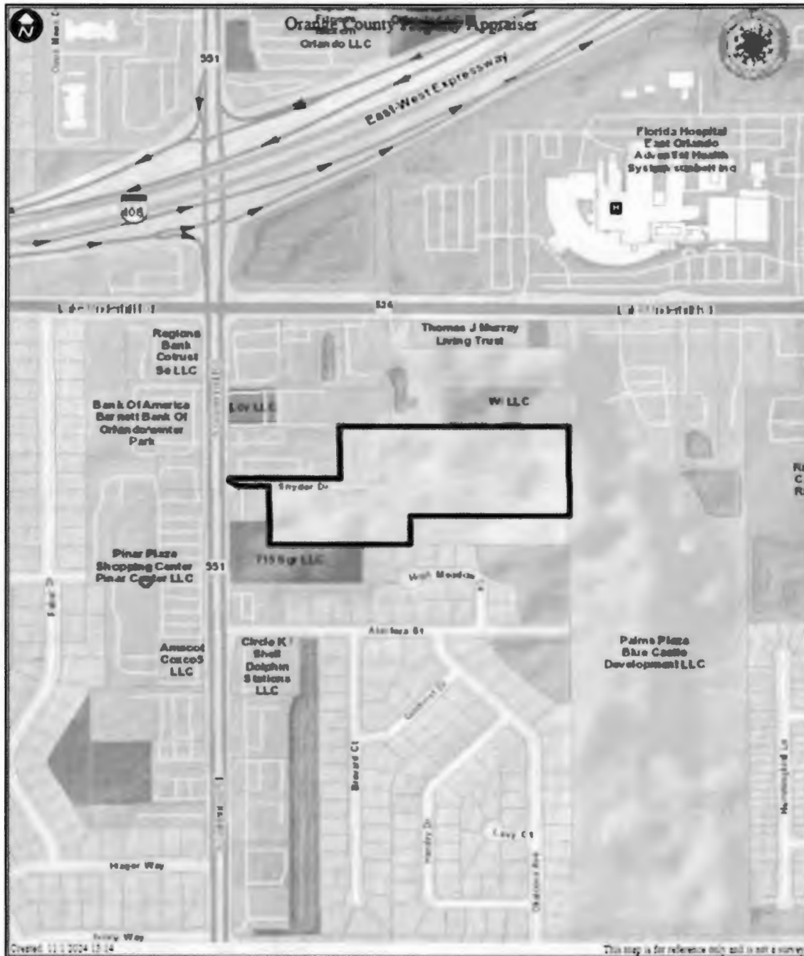
Exhibit "A" "CARDINAL POINTE" Project Location Map