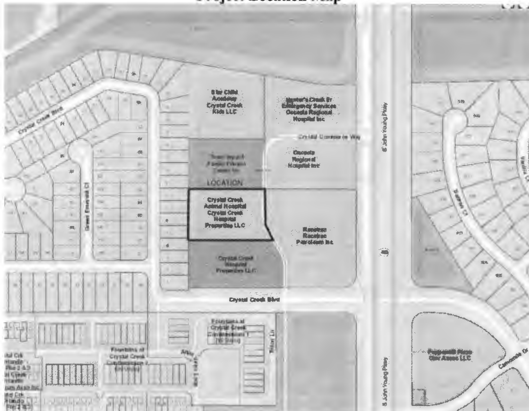
Project Location Map