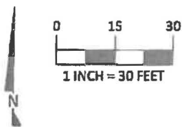
EXHIBIT "A" SKETCH OF LEGAL DESCRIPTION SEC 1, TWN 23 S, RNG 30 E EASEMENT VACATION