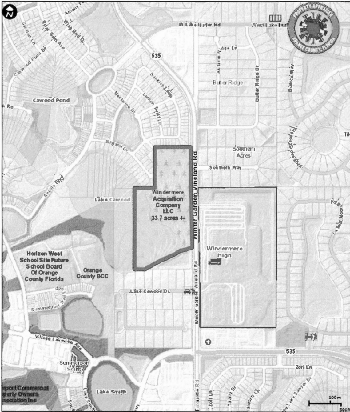
Exhibit "A" "SELNIK PD" Project Location Map