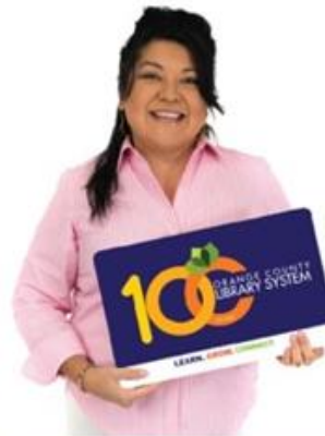
Orange County Commissioner Mayra Uribe