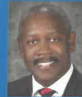
ORANGE COUNTY MAYOR JERRY L. DEMINGS

FROM SOUTH OF SUMMERLAKE PARK BOULEVARD TO TABORFIELD AVENUE