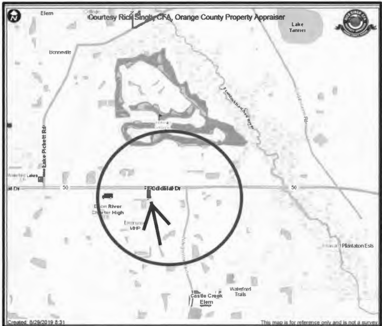
Exhibit A “DR. MOLE VET OFFICE” Project Location Map