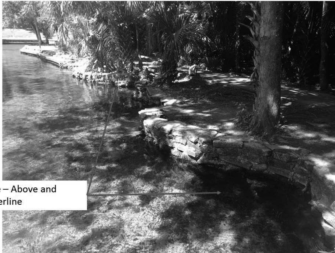
Wekiwa Springs State Park – Spring Bulkhead Repair

Wall Failure – Above and Below Waterline