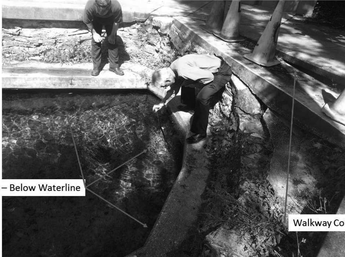
Wekiwa Springs State Park – Spring Bulkhead Repair