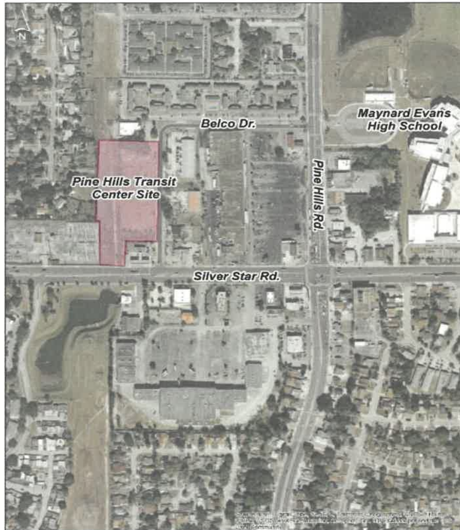
EXHIBIT A – SKETCH #1