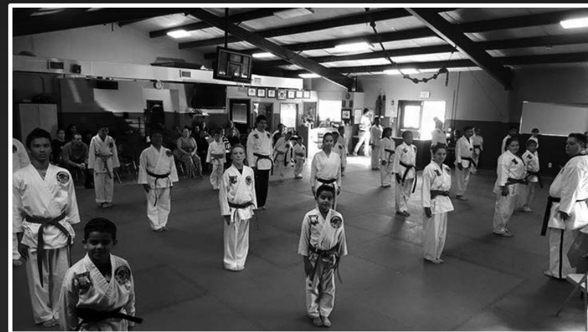
Unity Youth Fellowship