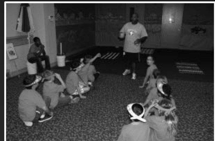
Greeneway Church Youth Community Center