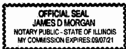
Name of Notary, Typed, Printed, or Stamped