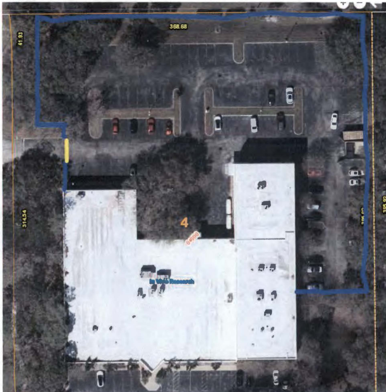
Figure 2 Decorative, Secure Fencing