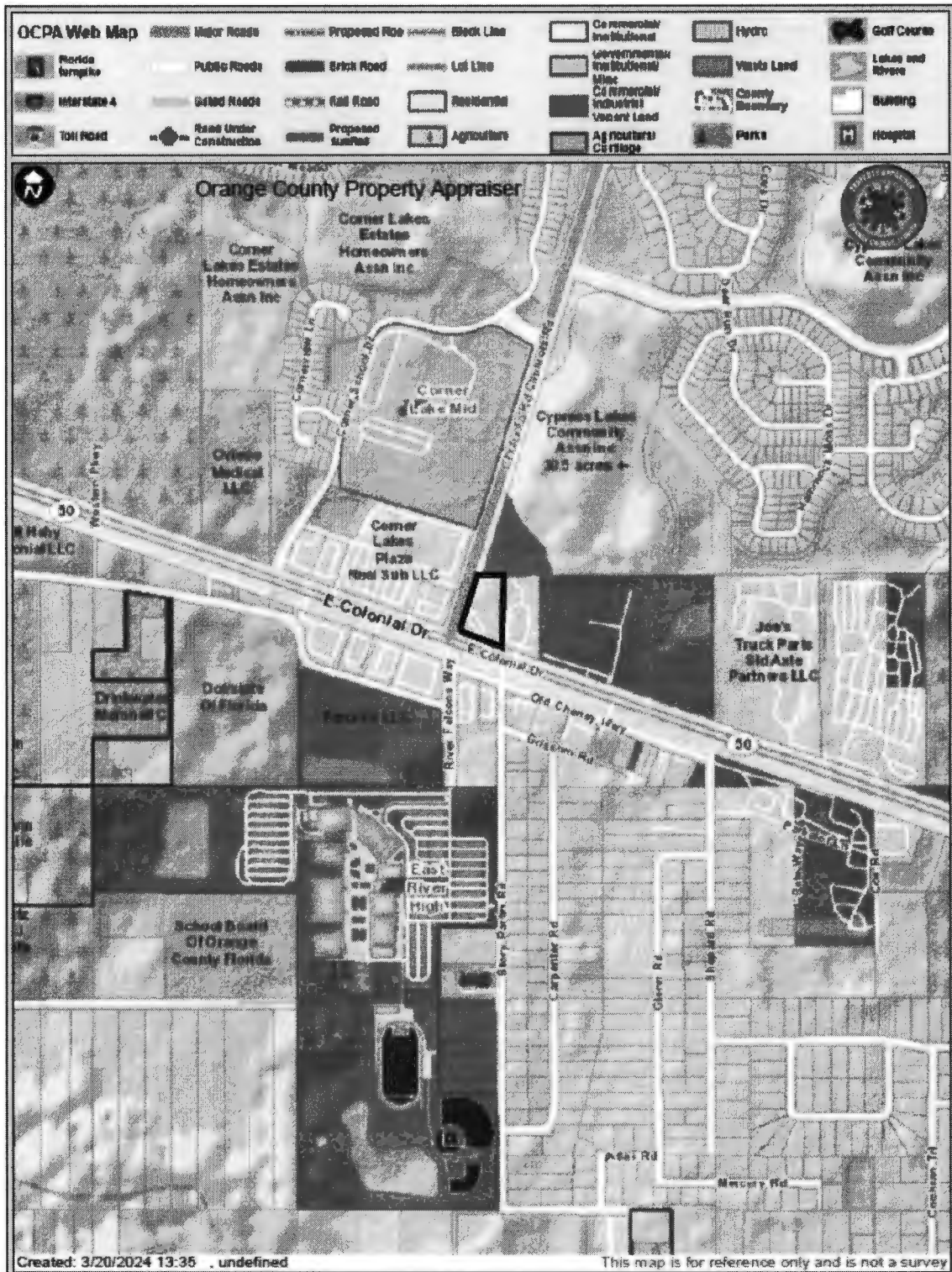
Exhibit "A" "WAWA - SR 50 & CHULUOTA" Project Location Map