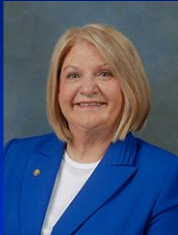
Senator Linda Stewart District 13