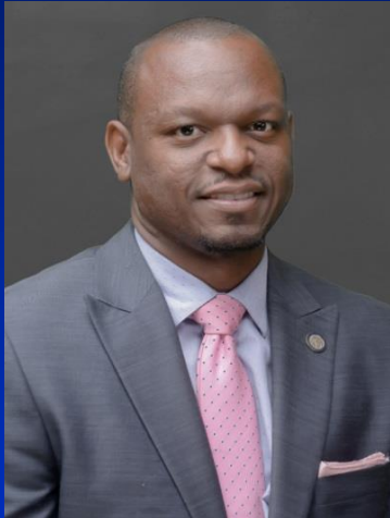
Senator Randolph Bracy District 11