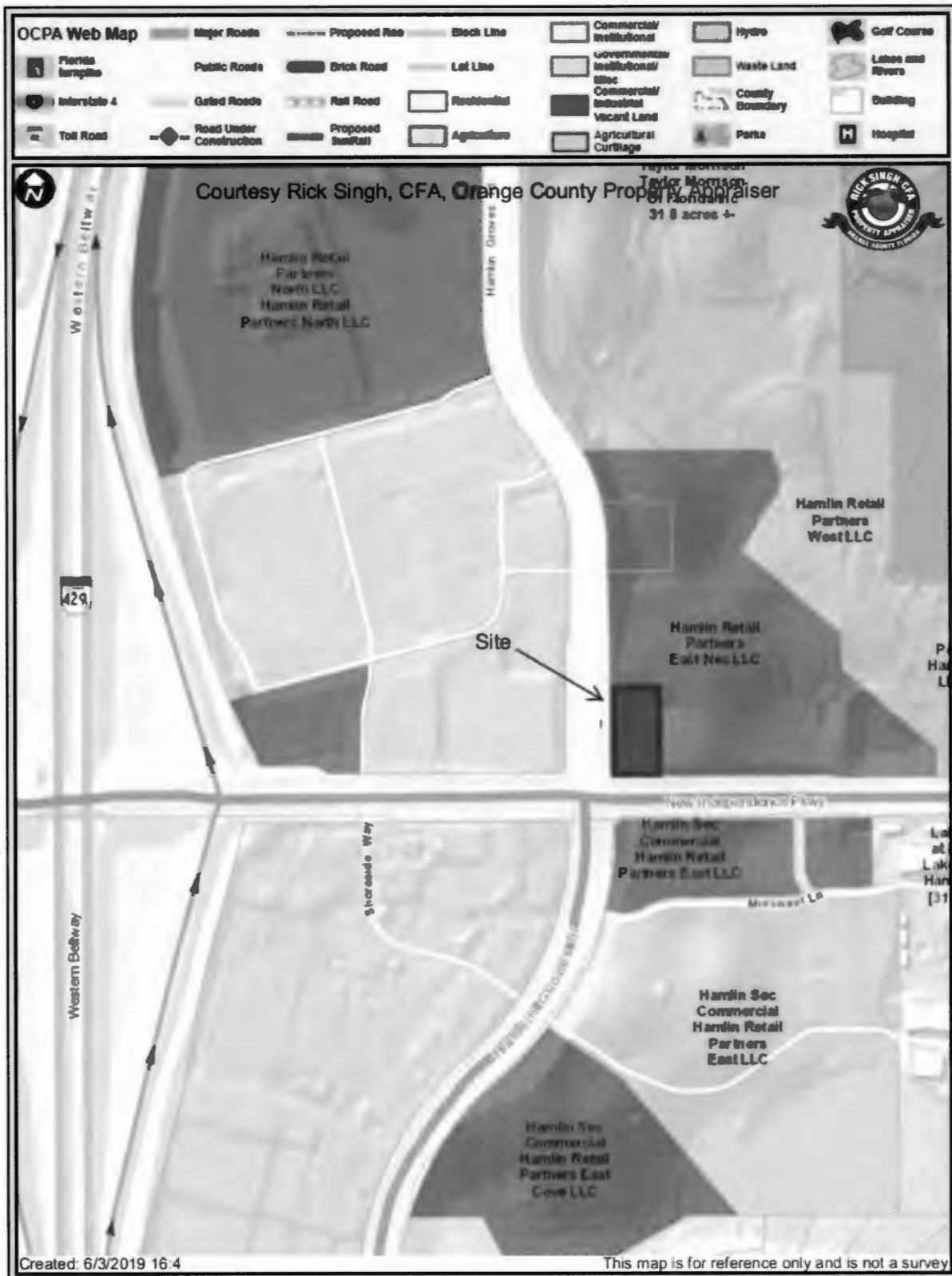
Exhibit "A" "SunTrust Bank at Hamlin" Project Location Map