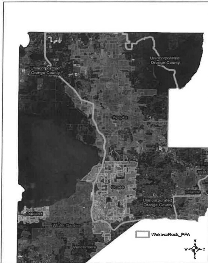
Figure 1. Project Location: Wekiwa and Rock Springs PFA

Note that, per Section 8.h. of Attachment 1 in the Agreement, authorization for continuation and completion of work and any associated payments may be rescinded, with proper notice, at the discretion of the Department if the Legislature reduces or eliminates appropriations. Extending the contract end date carries the risk that funds for this project may become unavailable in the future. This should be a consideration for the Grantee with this and future requests for extension.