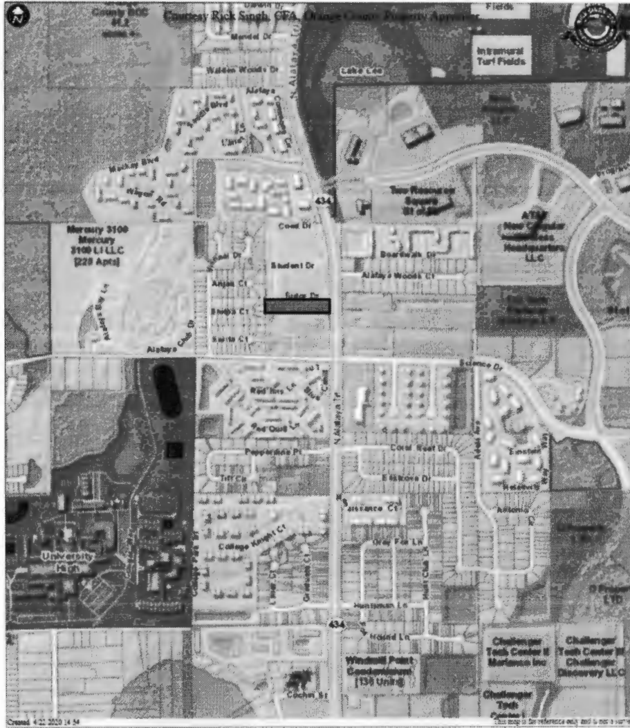
Exhibit A “CHABAD AT UCF” Project Location Map