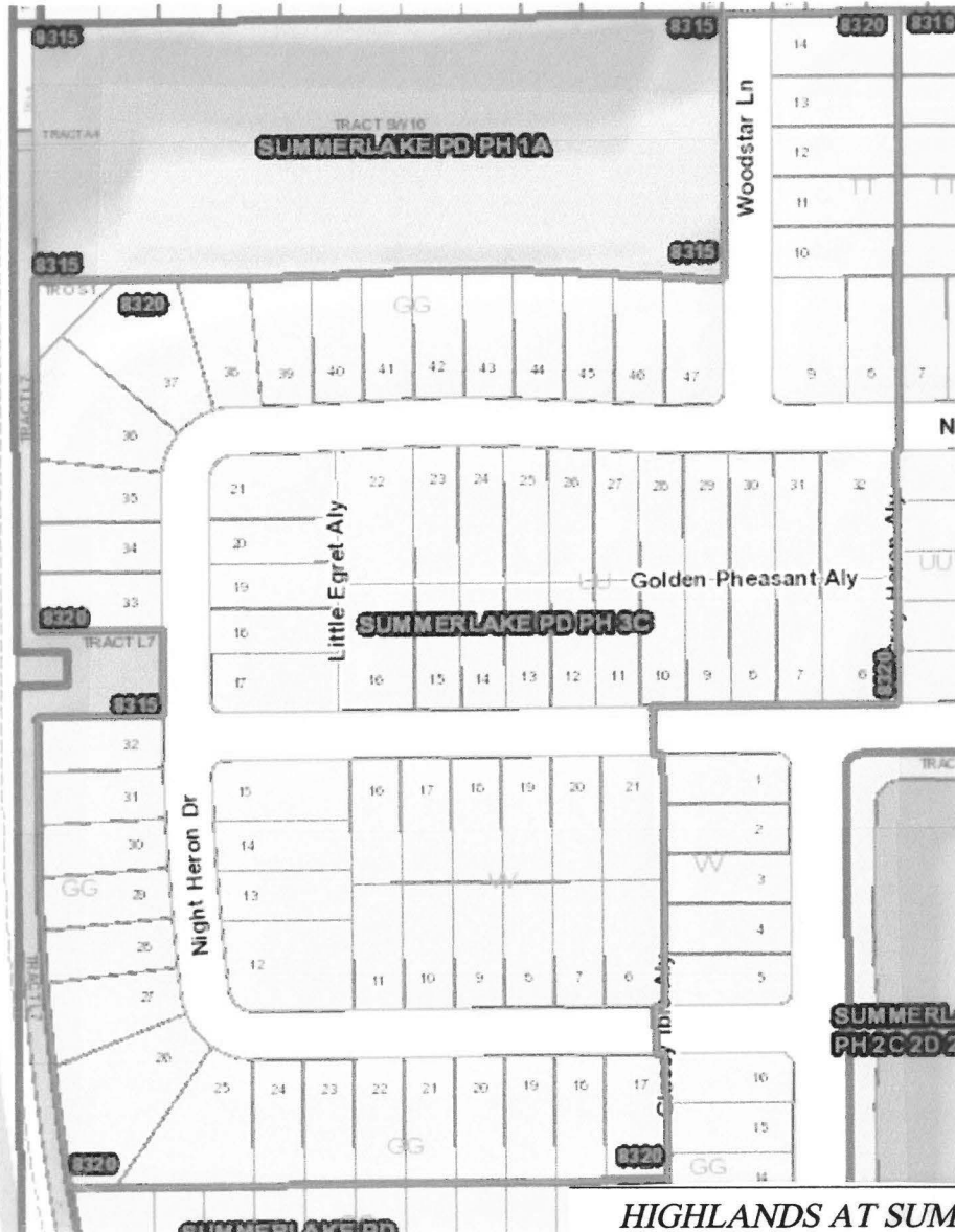
HIGHLANDS AT SUMMERLAKE GROVES PHASE 3C