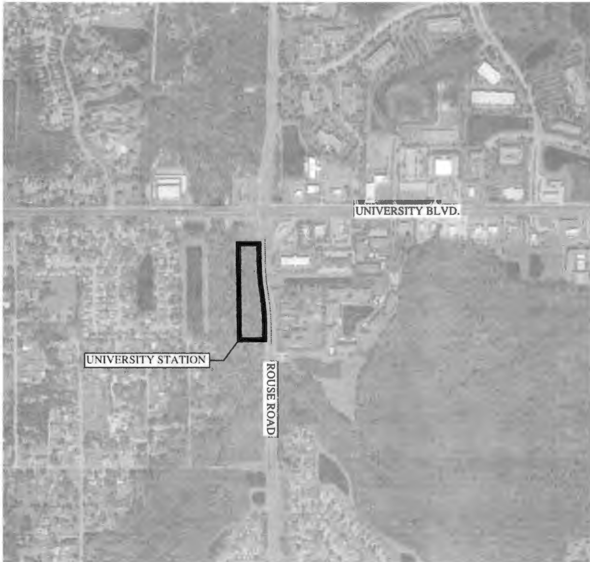
Exhibit A “UNIVERSITY STATION” Project Location Map