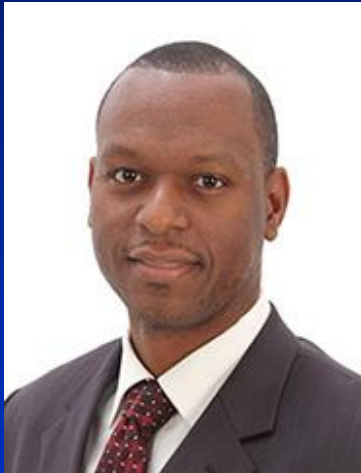
Senator Randolph Bracy District 11