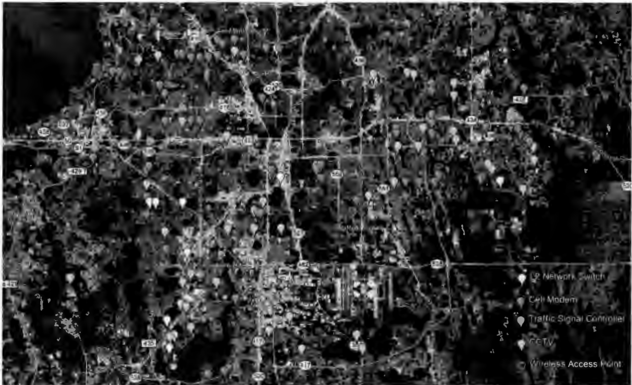
Orange County ATMS Phase 4 – Off System transportation fiber and ITS devices