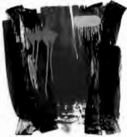
Continuum 6662 Han Shan 2016 36" x 36" Acrylic, Enamel and Spray Paint on Canvas

For inquiries, please contact: patriok@kahnocontemporary.com