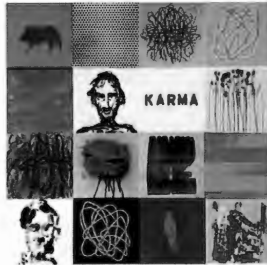
GRIDS (K A R M A)