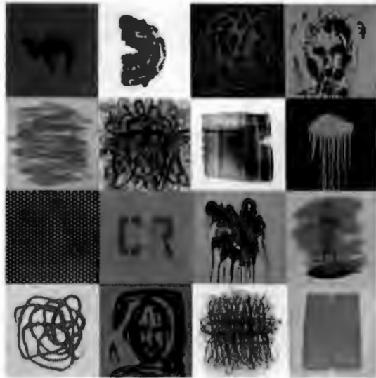
GRIDS (C R)