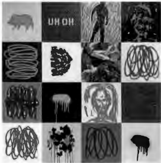
GRIDS (U H O H)