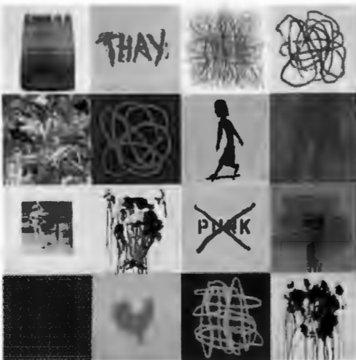
GRIDS (P U N K)