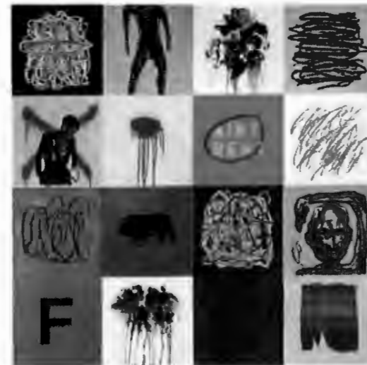
GRIDS (A I N T R E N T)