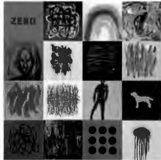
GRIDS (Z E R O)