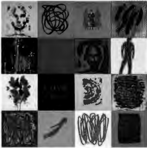
GRIDS (LOVE POEM)