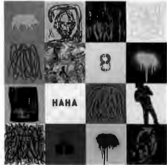
GRIDS (H A H A)