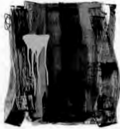
Continuum 7167 Terenoe Maliok 2016 Acrylic, Enamel and Wax Pastel on Canvas 36" x 36"

Courtesy of the artist and Snap! Orlando For inquiries, please contact: patriok@kahnocontemporary.com