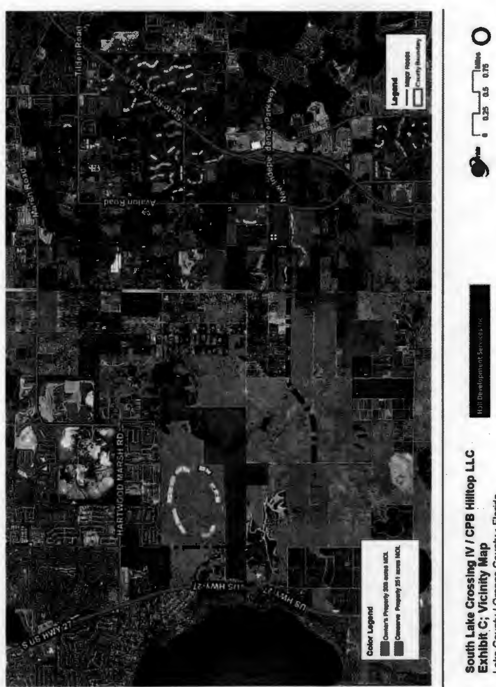
EXHIBIT C Vicinity Map

South Lake Crossing IV / CPB Hilltop LLC Exhibit C; Vicinity Map Lake County / Orange County - Florida