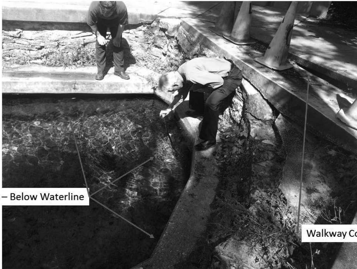
Wekiwa Springs State Park – Spring Bulkhead Repair