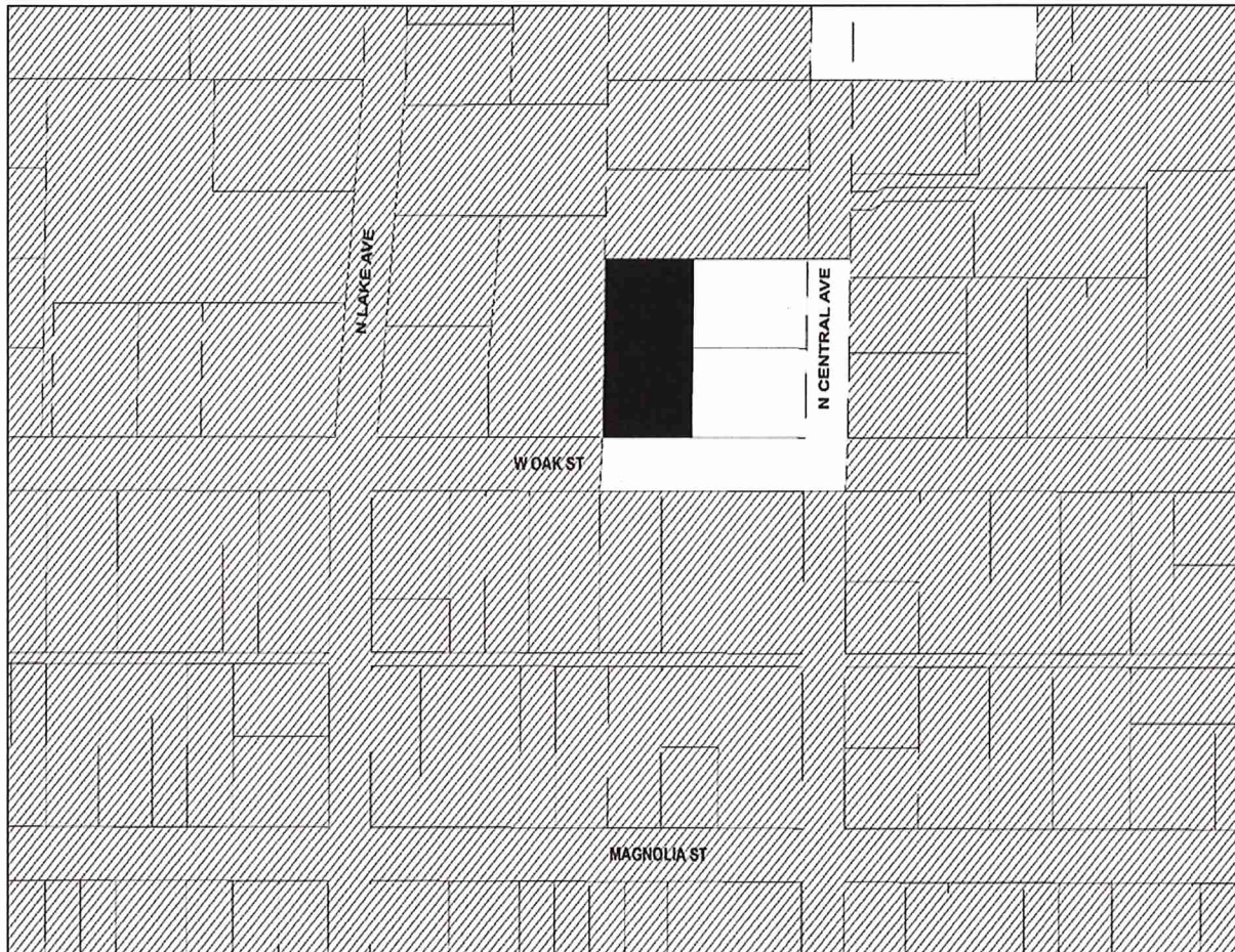
Exhibit "A" Ord. # 2529 Parcel ID: 04-21-28-4836-00-680